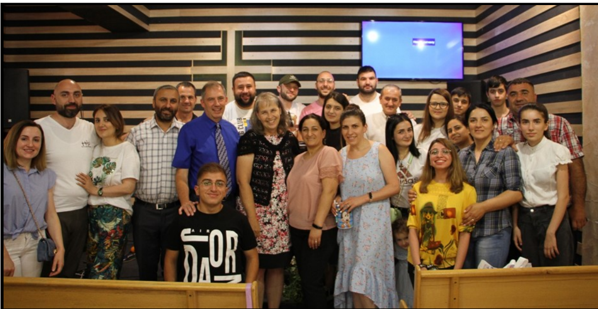
The Bethlehem Church of Yerevan, Armenia

In addition to the IBBC college courses I taught at the Bethlehem Church in Yerevan, I was also invited by the church in August of 2020 to teach Acts 17:16-34, Paul's Athens Speech, at a Bible camp up high in the