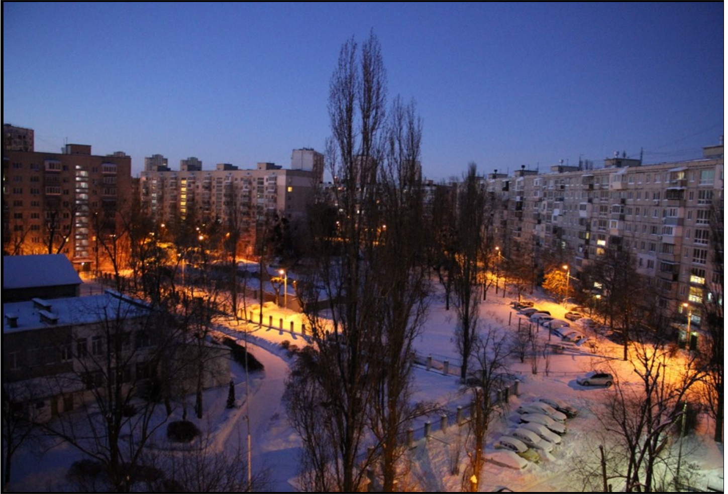
February of 2021 was very cold in Kyiv with lots of Snow and Wind

December was very special in Ukraine as I taught Proverbs in Rivne, a new ministry place which opened up to us. Again,