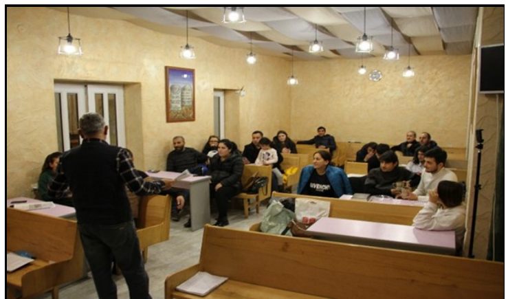
IBBC College Course at the Bethlehem Church

An hour south of Yerevan in a village called Sweet Town, we were able to get a church group up and going to meet regularly, something which they had never done in their history. Before the virus chaos, for a number of years, they might have met perhaps once a month at best. In January 2020, I taught there once. However, during the virus madness, this church group was completely abandoned, as so many churches were all over Armenia. This in itself, shows the more sinister aspect of the virus lockdowns. At a time of fear, when God's people needed real Bible teaching and fellowship, it was denied them. Others used the lockdowns as an excuse to stop caring about going to church. What-