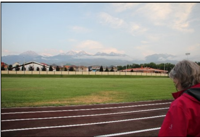
Almaty International School, Kazakhstan

Since we too have been caught up in the fallout of the virus (see lower left picture on page 1 packing up and moving to Ukraine from Armenia), somewhat against our presumed plans, we were forced to make some decisions we were not quite ready to make. Yet we did. We will thus do our best by God's grace to play the hand we have been dealt. We thus decided to purchase a townhouse near Kyiv, Ukraine in which we will, hopefully sooner rather than later, eventually 'retire' in and work from there. If our world continues to lock itself down off and on again with no place to travel, or to travel with so much difficulty, Ukraine is the best place for us to be since we have so many ministries there. The townhouse will also help us get proper residency so we can live there with no visa problems. Yet the townhouse is not ready to live in yet, and we still need to work to pay all the bills, and so we have been sent now to Almaty, Kazakhstan this time around. Caren will be a second grade teacher at Almaty International School this year. I will be finishing up much doctoral work in Almaty this year working under the mentorship of Dr. Wayne House and Dr. Leroy Goertzen, but will also, by the Lord's travel mercies, to go to Ukraine, Armenia, and other former Soviet countries to continue our teaching ministry in those places as before.