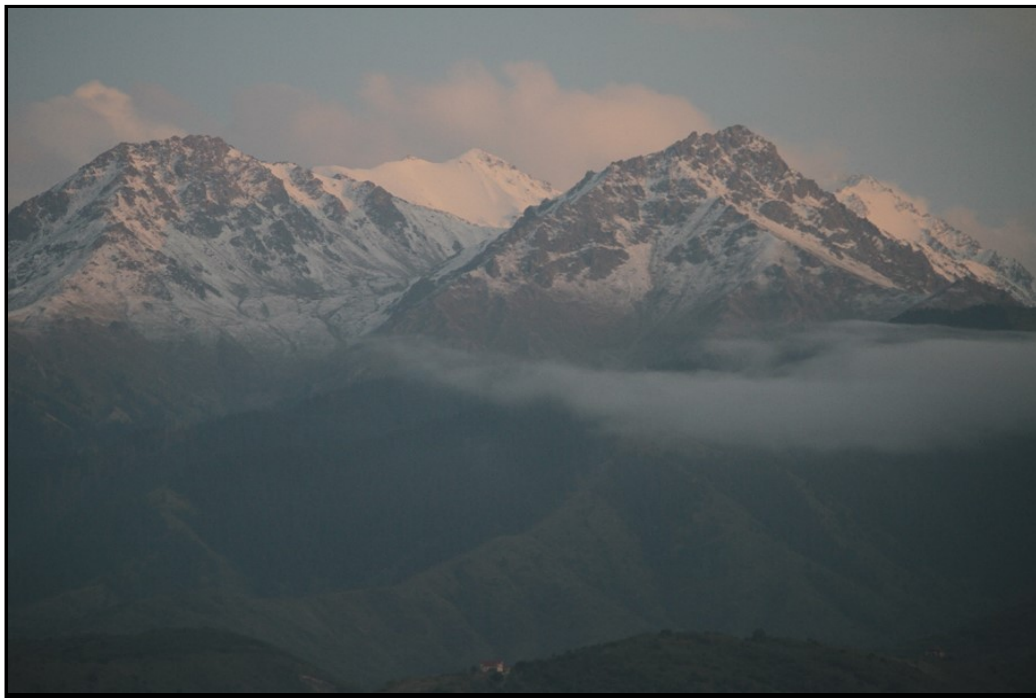
The Tien Shan Mountains above Almaty rise to heights well over 14,000 feet and are heavily glaciated in the higher peaks and mountain valleys

Kazakhstan is a very beautiful country in the Almaty area, but also restrictive—at least on paper. Thanks to Almaty's strong Russian background and influences, among many other reasons, it is the most open city in Kazakhstan. Kazakhstan is a secular semi-Marxist Muslim state of sorts with a super surveillance system technocratically watching over its citizens pretty closely - allegedly in the name of fighting against corruption and religious extremism, but now also against the virus. We will do our best to encourage folks as best as we can around these parts, and develop good relationships, so that hopefully some good teaching ministries will arise in the future. Please pray for us! Like you as well, we live in very serious times.