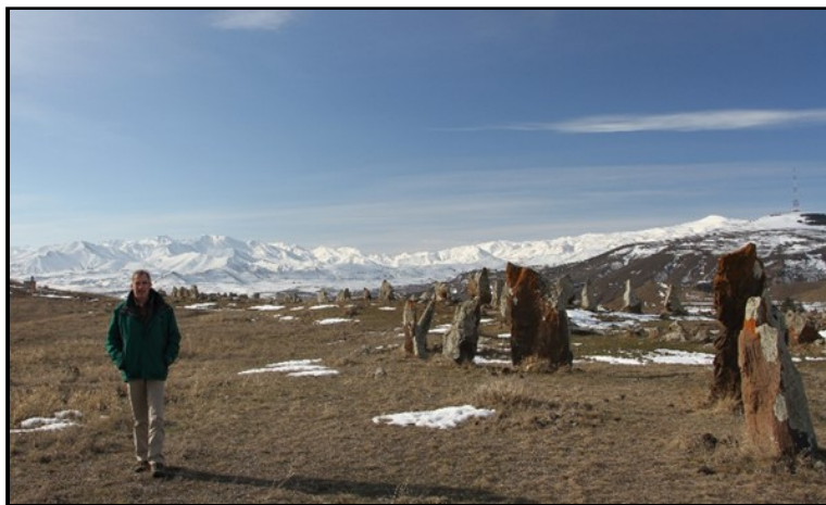
The Armenian Stone Henge of Carrahunge in SE Armenia

makes liberty at the very heart of the missionary mandate in 1 st Corinthians 9:19-23, which I have tried to emulate in my life as much as possible.