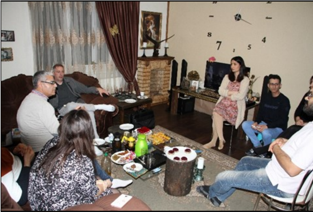
Teaching Iranians on the Deity of Christ and Salvation by Grace at a home Bible Study outside of Kyiv during yet another lockdown in the Capital City

When I returned to Kyiv in February- March 2021 to teach Romans at the Bible college, we continued such efforts with Iranians in their own homes during the very cold weather, but also continued our 1 st Corinthians ministry in Regeneration Church. In April, I again returned to Ukraine, this time to teach Proverbs in another Baptist Church connected to IBBC in Vinnitsa. The church group in Vinnitsa heard about how good the class was in Rivne, and so I was invited to teach it again in Vinnitsa. Again, this was my very first-time teaching in Vinnitsa as well. Once again, the teaching was well received. Furthermore, we continued all year off and on to encourage the church in Baryshivka, a church we have been ministering to for more than 20 years now. We wrapped up the summer here in Ukraine by traveling to Dnipro to do some teaching on missions to a small Bible institute group of graduates.